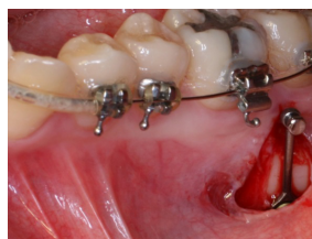
Fixation of Mini Plate