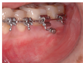
One year later